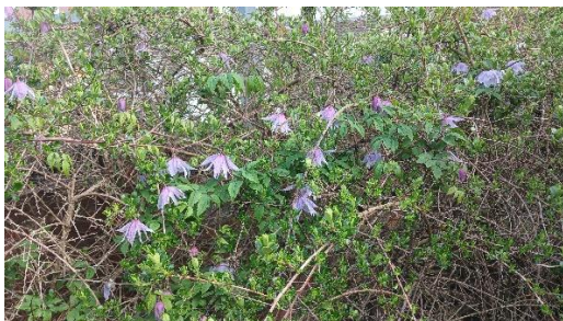
Clematis macropetala Westleton

“To have a garden where nature and the climate do everything, and man is called upon to do little more than scratch the ground and gather the flowers and fruit, might be very pleasant from one point of view, but it would take away all that to me constitutes the real interest of gardening, in its difficulties, and even its disappointments.”