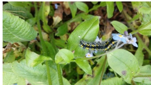
Scarlet tiger moth caterpillar